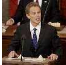
Prime Minister Tony Blair