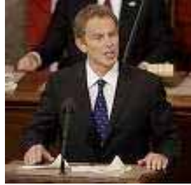
Prime Minister Tony Blair