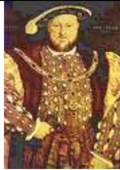
King Henry VIII